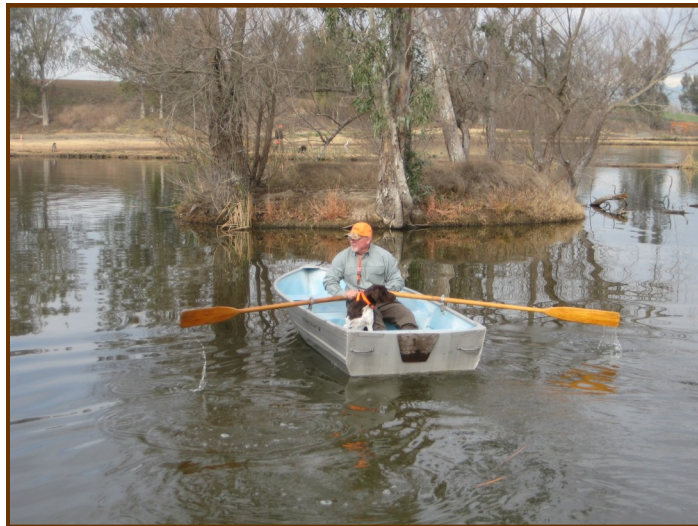
Voyage to "Falco Island"

Honey I'm getting tired of that dog whining, can't we do something? Have you checked on him lately? No he's not whining.