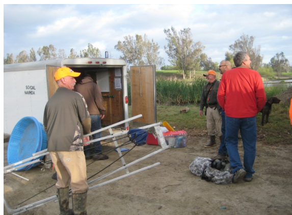
It's in there somewhere