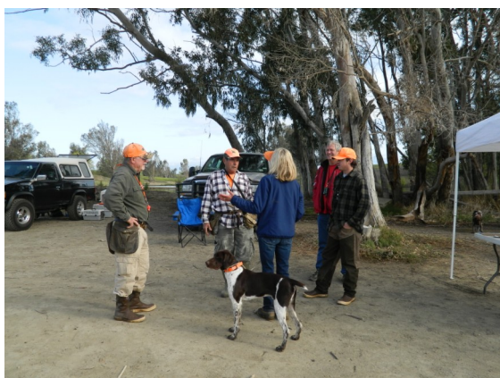
Getting ready for the day's training