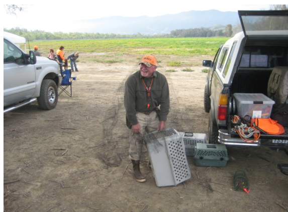
Patent-pending bird saver device